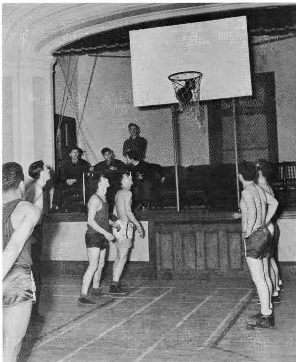
Site of present gymnasium as it appeared in 1938 as combined gymnasium-auditorium.