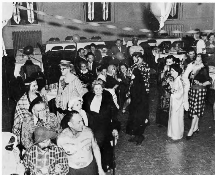
Masque Ball 1958.