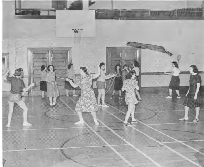
Girl's Gym Class 1945.