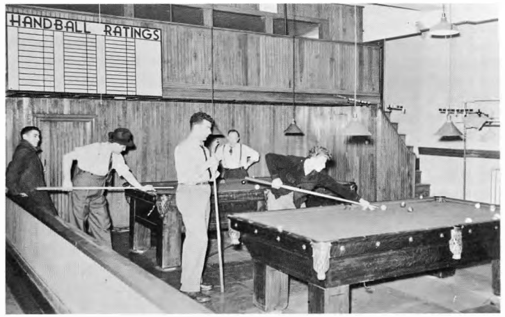
Billiard Room 1943.