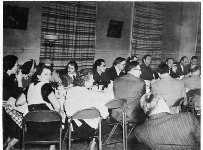
C-day (dues collection) Breakfast 1955.