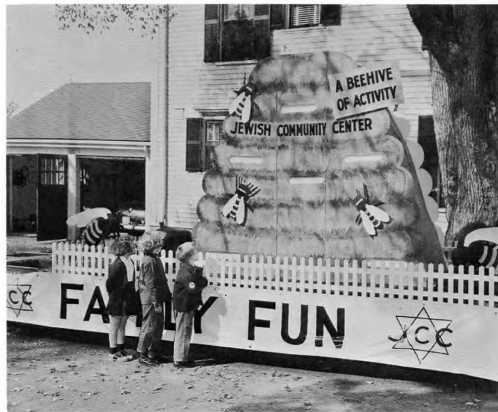
Community Chest Float 1947.