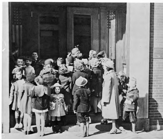
Let Me In!!