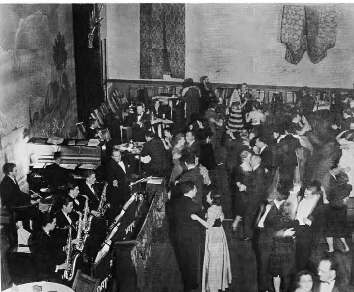
New Year's Dance 1939.