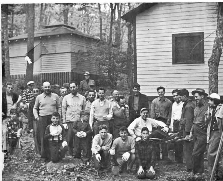
Day Camp Clean-up Crew 1948.

The idea of a summer day camp, explored during the previous administration, now became a reality. A camp site was purchased with money from the Norman I. Godfrey Memorial Fund founded by me but supported by many.