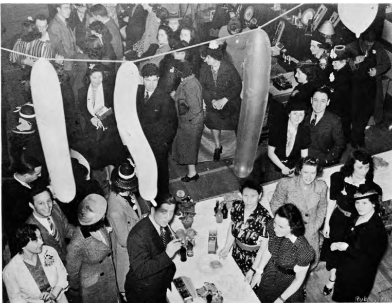
Purim Carnival 1946.