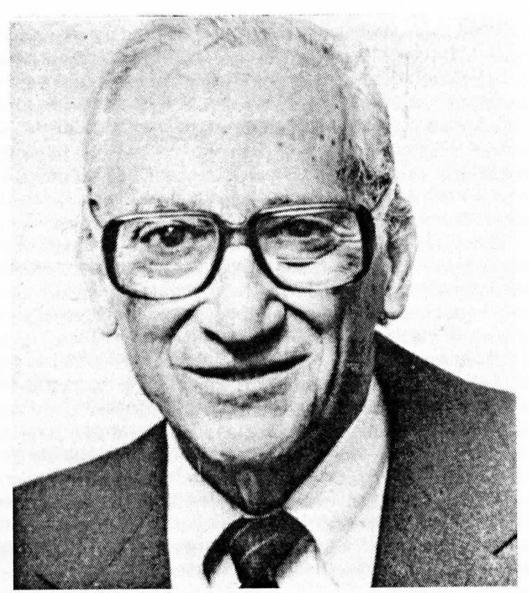
Veteran Sportswriter Shirley Povich