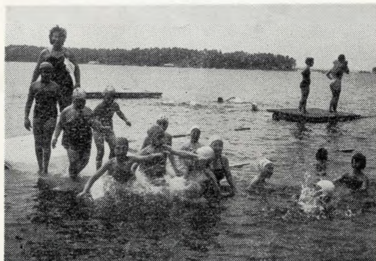
SWIMMING AT DAY CAMP WATER FRONT

These and many other featured attractions will be held this Sunday -