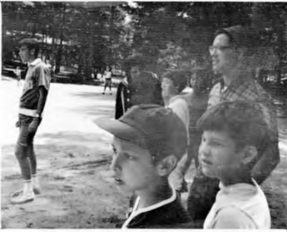
Watching the action at IB versus AG ball game