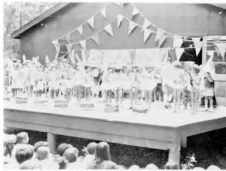
Entire cast of the Youth Group Circus