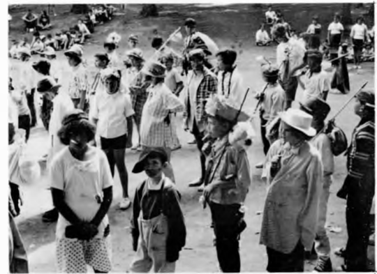
Here's the line-up for Hobo contest