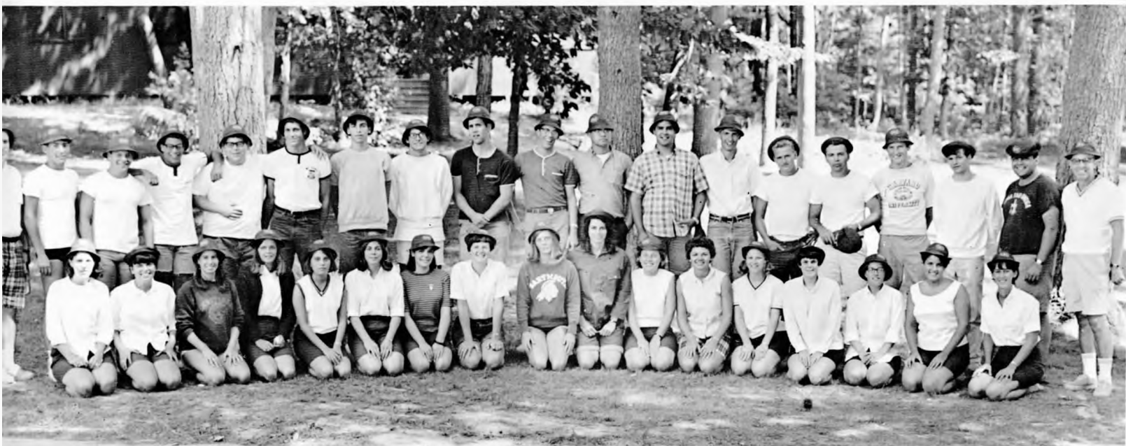
THE HEART OF CENTER DAY CAMP — ITS STAFF 1966