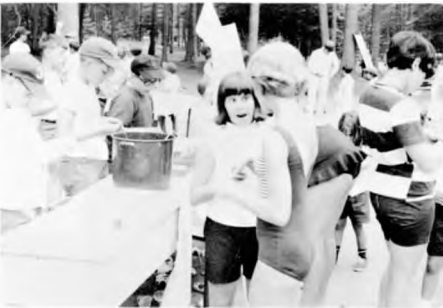
Visiting AB booth during Carnival Day