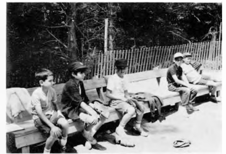
Lemme get in there, Coach