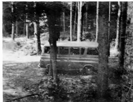
Here's a staff member who really rolled