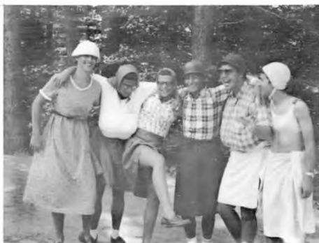
The "girl" cheerleaders before IB - AG game