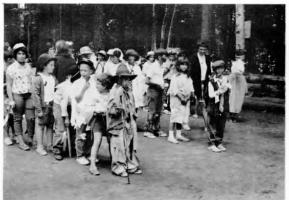
A bunch of hobos lined up for judging during Maccabead — notice us IG's