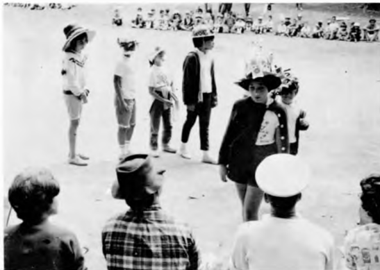
Hat parade before the judges