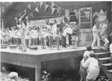
Opening "Grand Parade" for Y. G. circus