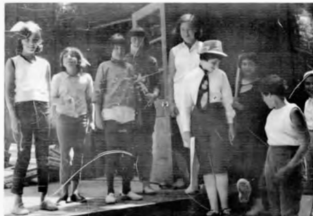
Backstage with AG before show