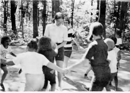
Girls do the hora