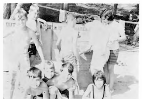
A group of us at the buddy board