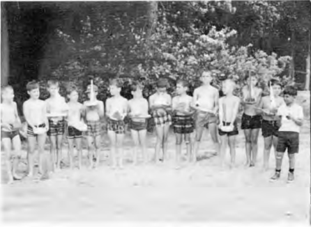
The proud Captains of Y. G. and their ships — Regatta Race