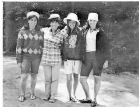
. . . and the "boy" cheerleaders — Some game