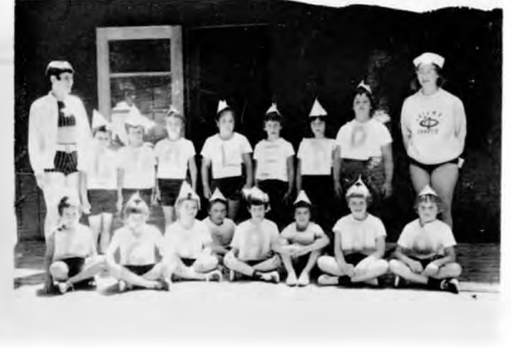
Debut of the girls to "show biz"