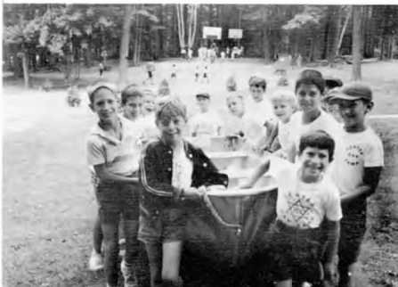
Which way to the water?