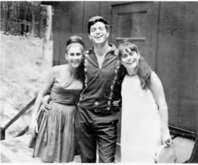
Entertainers from Israel