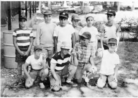
Proud fishermen with their "catch"