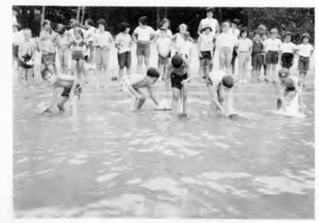
The race is on and notice the interested spectators