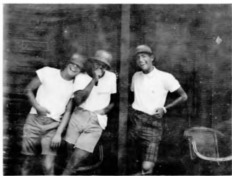
Laughing it up after a busy day