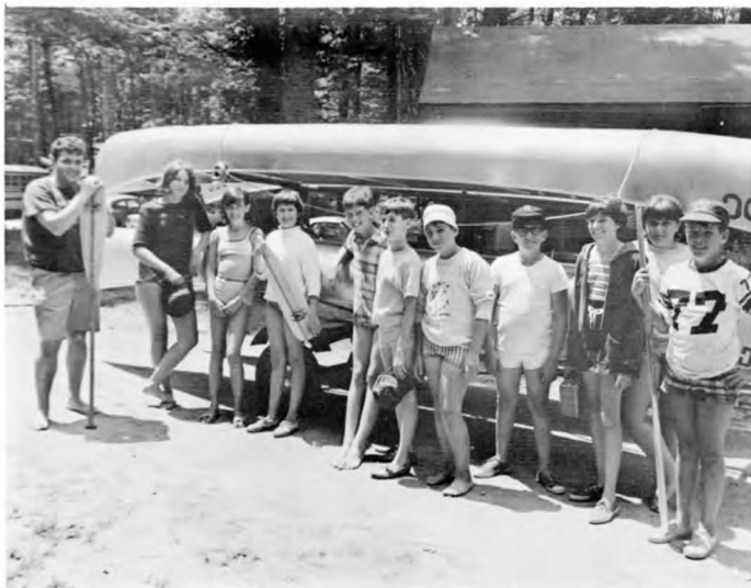
Getting set for overnight canoe trip — AB and AG