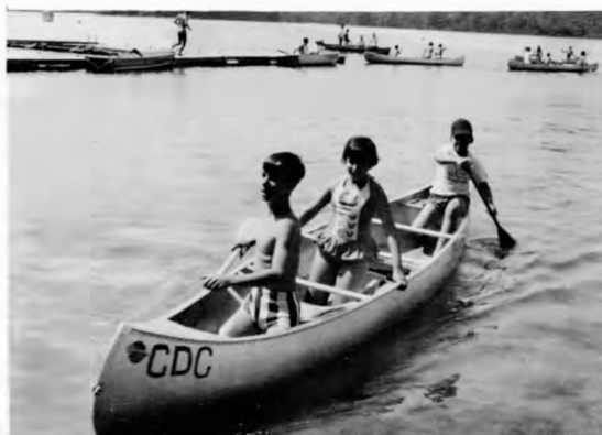
Winning team in canoe race during Camp Regatta