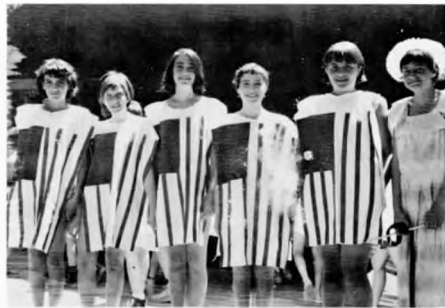
It's a grand old flag — 4th of July show