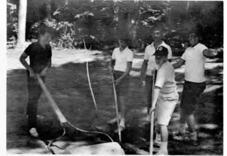
Look at us hard working campers