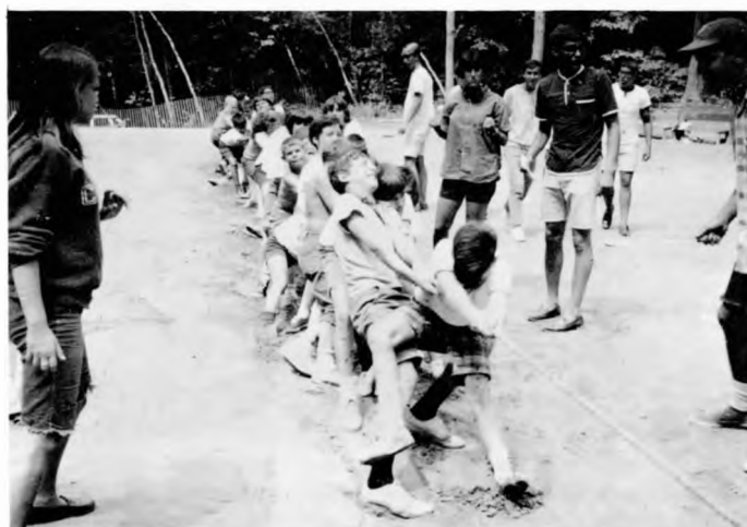
Pull — Action during Maccabeed