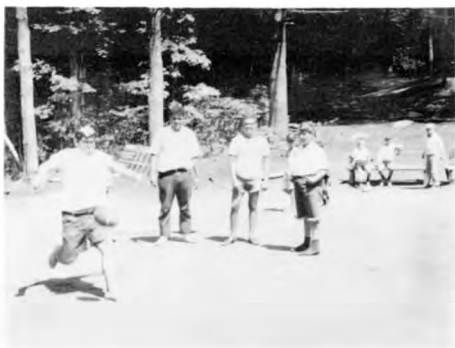
I'll kick it out of the ballpark — oomph!