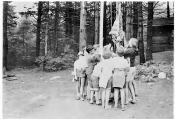
Carla's group wins the honor of lowering the flag