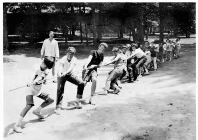
Oh no you don't — Pull team