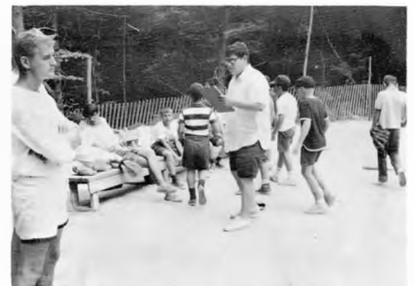
Here's the Coach giving the boys a pep talk