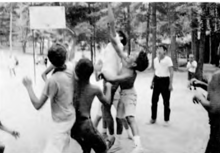
Some ferocious action during basketball game