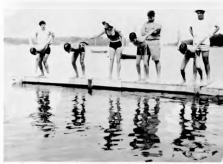
On your mark — get set — go — Water Carnival