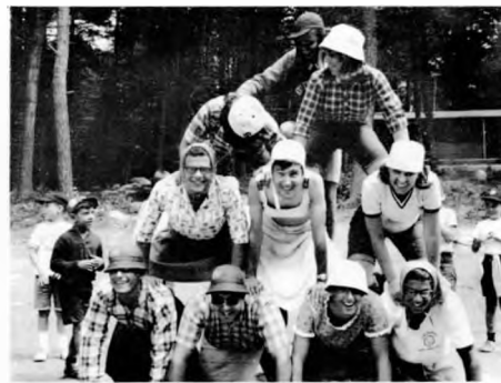
A pyramid of cheerleaders