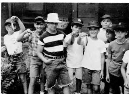
My fish was this L - O - N - G