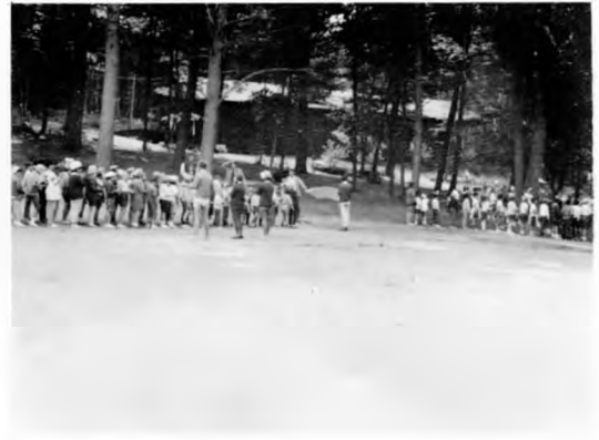
Teams lining up for Water Carnival