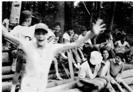
Talking it over during lull in action