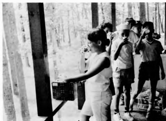
Milk call on the back porch