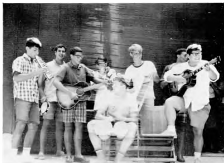
A rooten - tooten number during Counselor Show