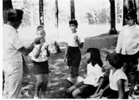
Camp photographer tries to line up girls for their picture