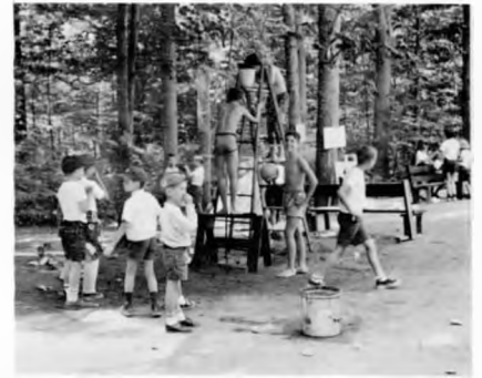
Setting up booth for Carnival Day