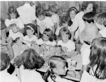
Annabelle surrounded with a group of young ladies