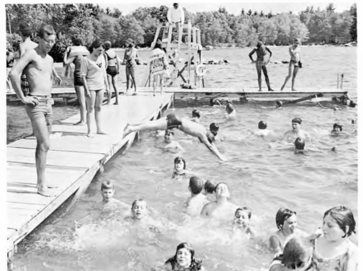
3rd Area during General Swim.