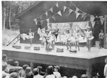
The graceful bareback riders entertain the enthusiastic audience