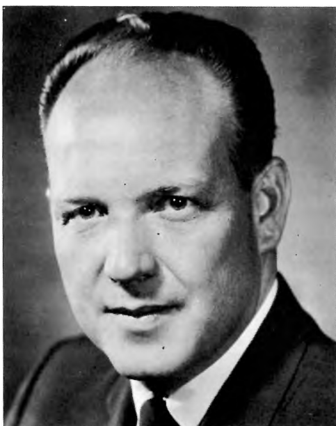
Stanley R. Tupper Member of Congress

I am delighted to take this opportunity to extend my sincere best wishes as the Jewish community prepares to celebrate the coming of their New Year and to also congratulate the Portland Jewish Community Center on its 25th Anniversary.