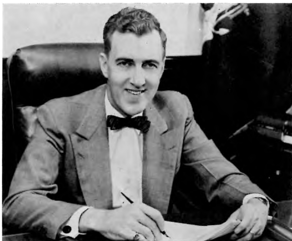
Edmund S. Muskie U. S. Senator

I welcome this opportunity to extend congratulations and best wishes to the Jewish Community of Portland on the 25th Anniversary of the Jewish Community Center.