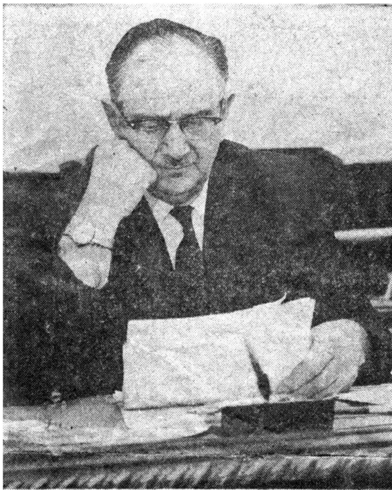
Before the message, a time of study