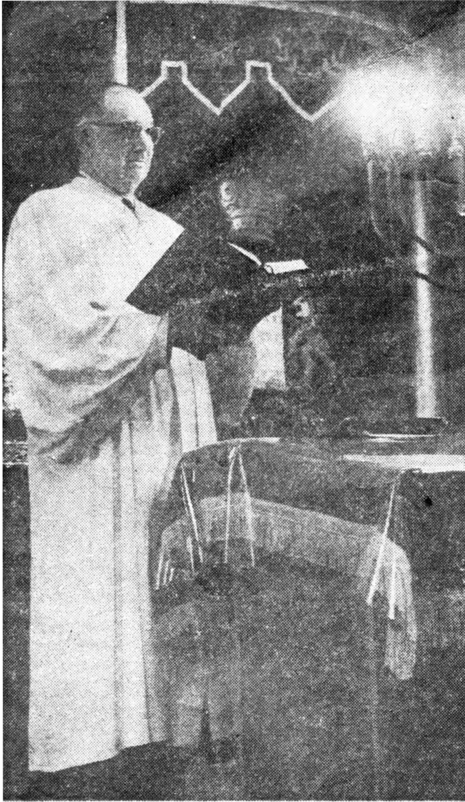
A reading from the Torah