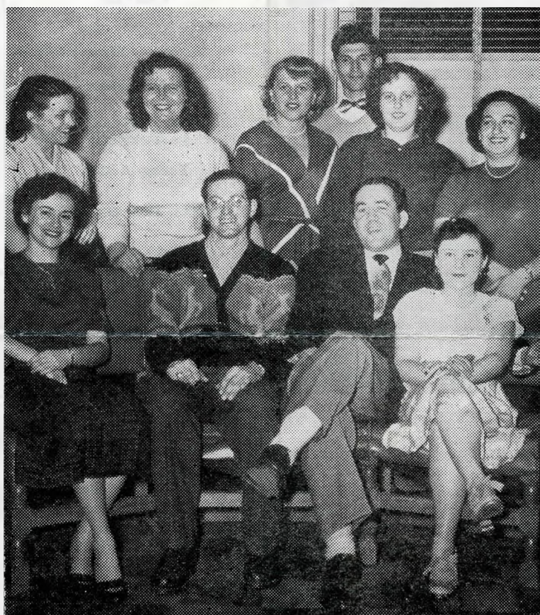
YOUNG ADULT PICNIC COMMITTEE