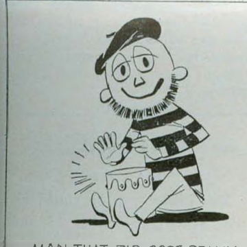
MAN THAT ZIP CODE REALLY SENDS ME ...