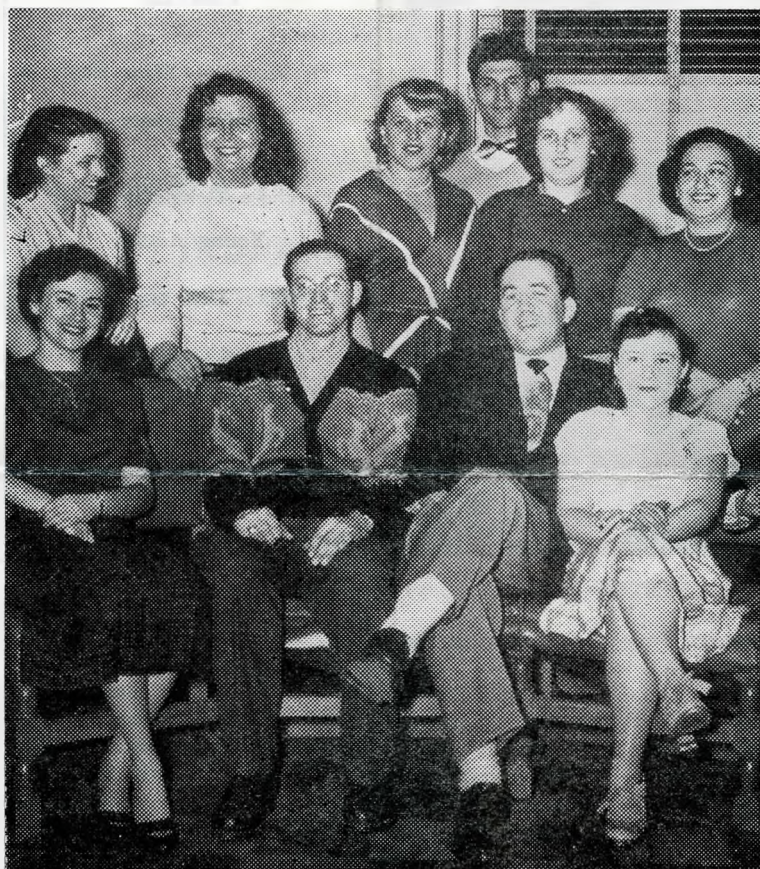
YOUNG ADULT PICNIC COMMITTEE