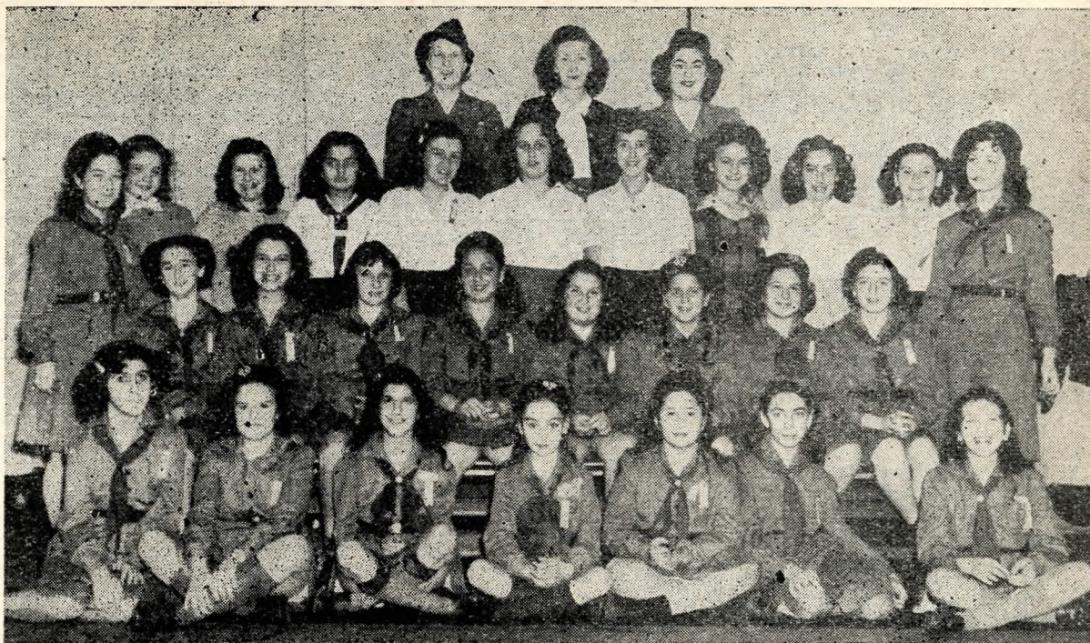
GIRL SCOUTS IN PICTURE ABOVE