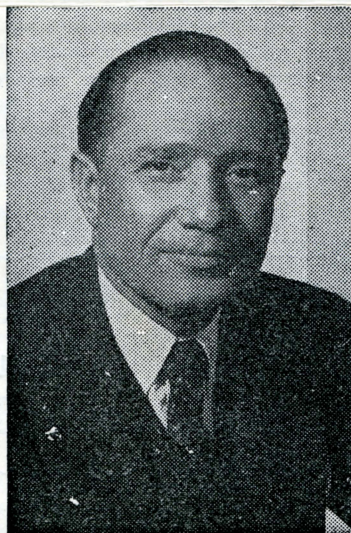
PHILIP M. KLUTZNICK