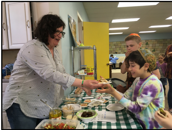
Ordering in Hebrew

This past month Hebrew School students celebrated and observed the early spring Jewish holidays of Passover, Yom ha-Sho'ah and Yom Ha-Atzma'ut.