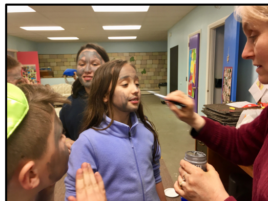
Face Painting with Dead Sea Clay