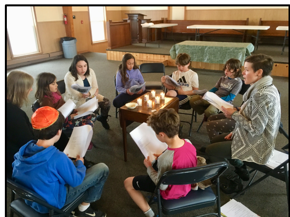
Yom HaShoah candle lighting ceremony