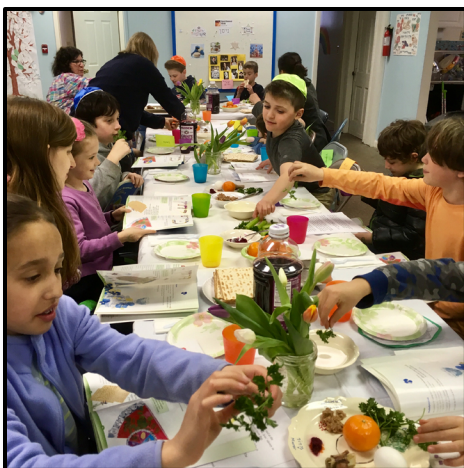
Hebrew School Passover Seder