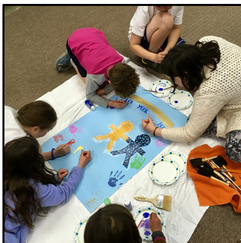
Banners over Bath Project