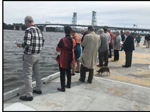
Taschlict on the Kennebec River