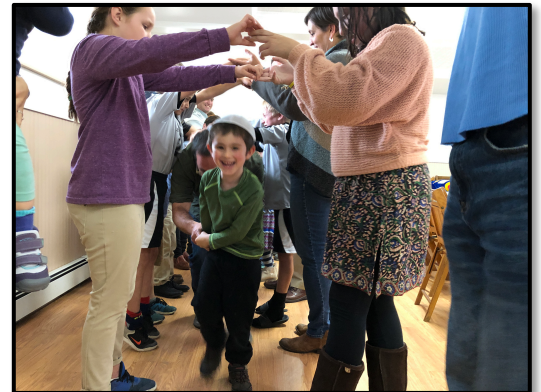
Simchat Torah Dancing