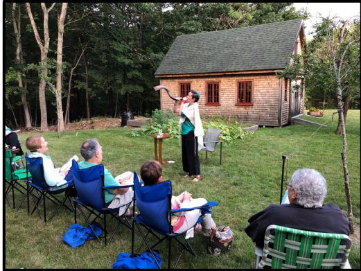
Our Shabbat Under the Stars in late August

We just finished a wonderful High Holiday season filled with multiple services and programs.