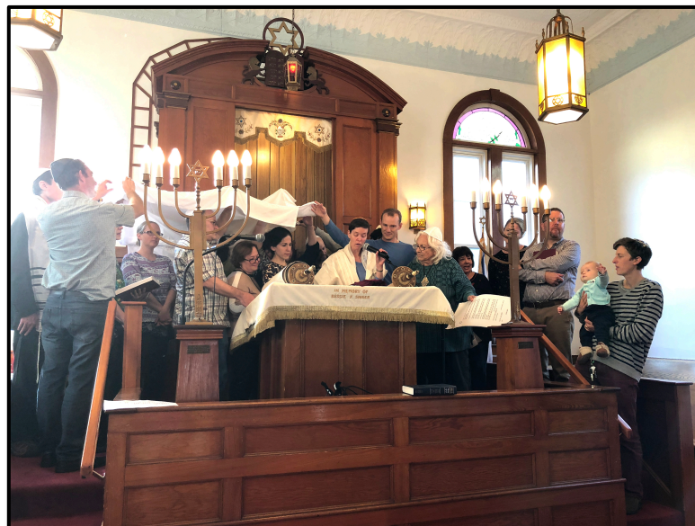
Simchat Torah Blessing