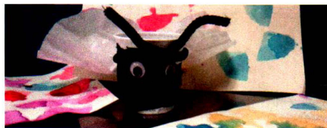
Apple prints and a bee honey dish made at the PJ Library Rosh Hashanah Celebration, Children's Museum & Theatre of Maine.

It was another incredible summer at CDC, with over 1,200 camper weeks and busloads of happy campers. Following a long and demanding review process, CDC was reaccredited by the American Camp Association this summer, a clear reflection of the expertise and care with which our fantastic staff approaches their work.