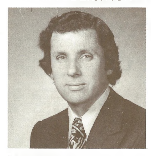
"... we do raise dollars, but if we don't raise the consciousness of the Jewish community, everything else that we want to accomplish will not happen."

The major goal of the Federation is raising Jews. Yes, we do raise dollars, but if we don't raise the consciousness of the Jewish Community, everything else that we want to accomplish will not happen.