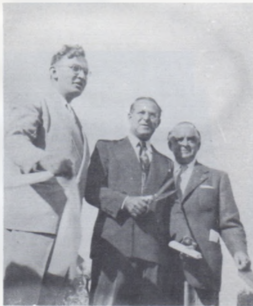
CUTTING THE RIBBON

During the summer the building continued to grow. Although still unfinished in September, the membership hoped they would have their High Holiday services